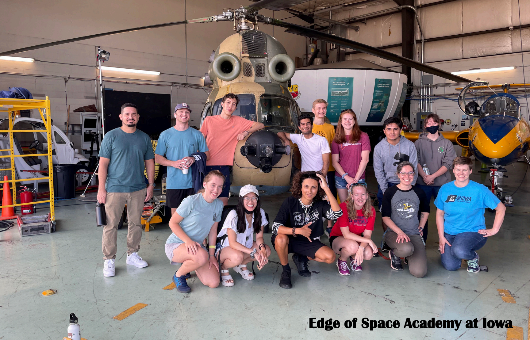
Edge of Space Academy at Iowa