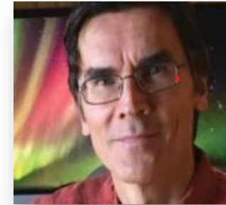
Andreas Keiling Solar-Terrestrial Research (STR)