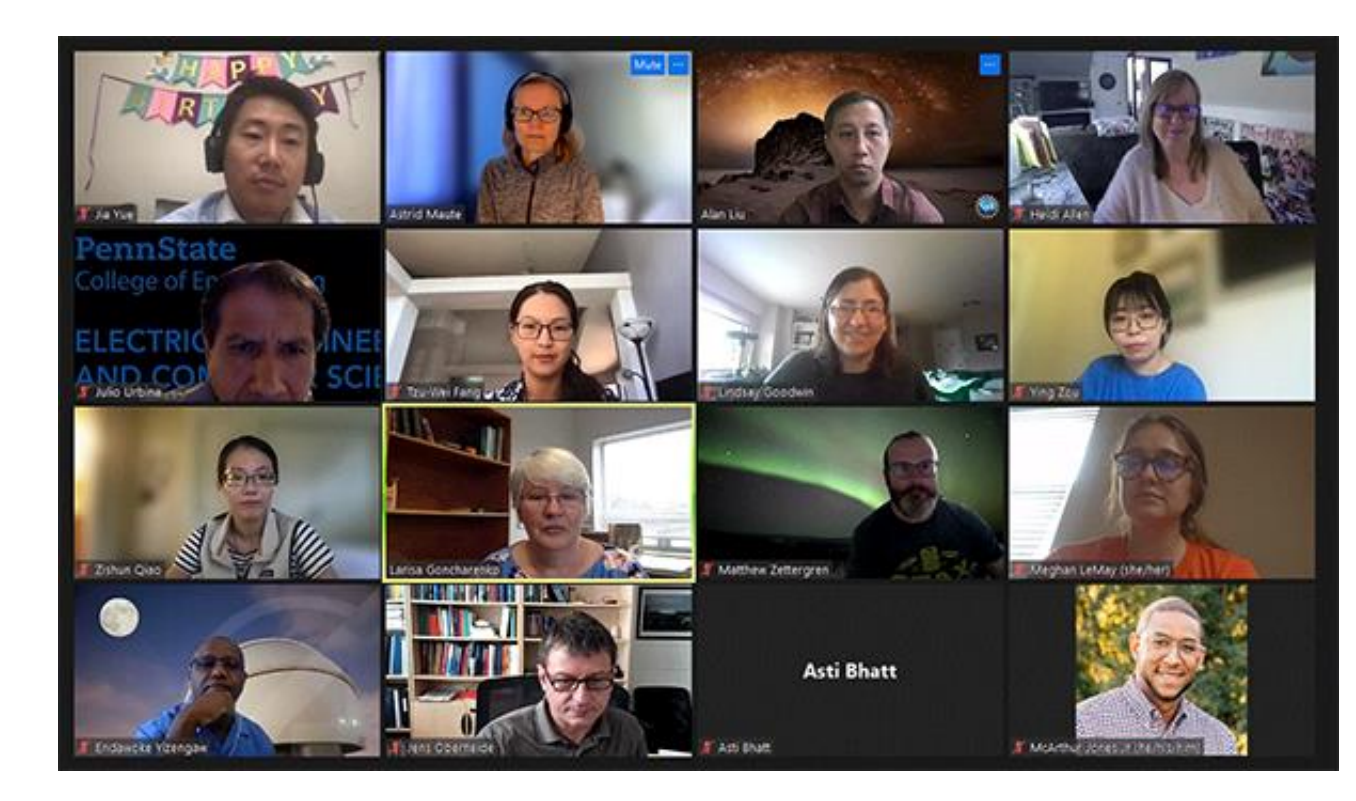
Steering committee zoom meeting, fall 2021